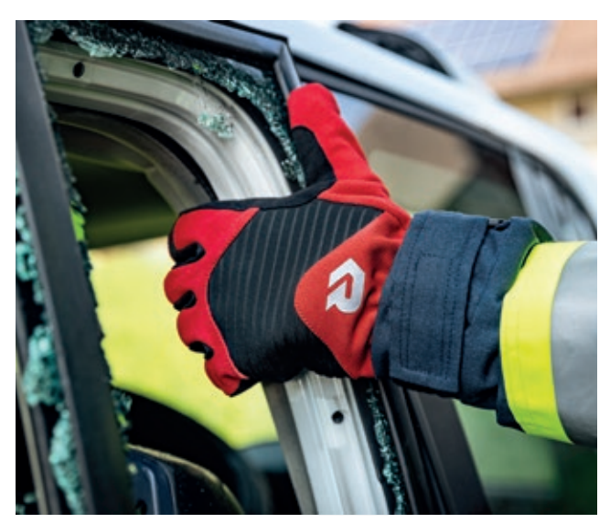
High mechanical protection properties against cuts, abrasions, etc.

The GLOROS T1 was specially developed for use in technical rescue operations. Certified according to EN 388, it offers the best protective properties against mechanical dangers like punctures, cuts, and abrasions. Whether it's work on vehicles involved in accidents or other fire fighting activities - the GLOROS T1 is the right glove for the protection of rescue workers. However, the glove does not protect against chemical, electrostatic, and thermal hazards and is not intended for use in fire operations (models for fire protection are available for these scenarios). Additionally, GLOROS T1 offers a certain basic protection against contact heat up to 250 °C (480 °F) (according to EN 407).