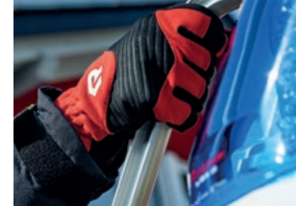
Perfect grip and high slip-resistance thanks to silicone coating