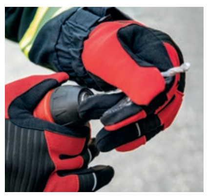
Excellent dexterity and high sense of touch