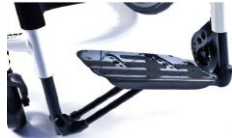
XFF050027 Footboard platform, lightweight, carbon fibre, auto folding