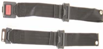
XFF 090018 Lap belt with buckle, metal