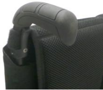
XFF 030201 Push handles long