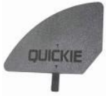
XFF040107 Composite sideguard detachable