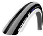
XFF070101 Schwalbe Right Run