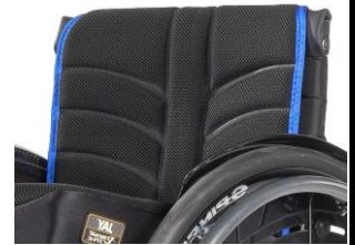
XFF 030317 EXO PRO backrest sling (EXO Evo version)