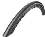
XFF070107 Schwalbe One