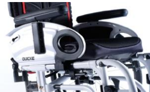
XFF04000x Desk sideguard, armrest, flip- up, removable