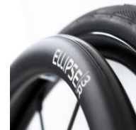
XFF070212 Handrims Ellipse 3R