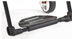
XFF050059 Footboard platform, performance