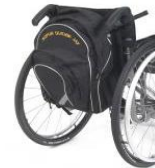
XFF090030 Back pack