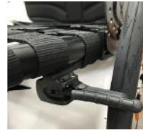
XFF060024 Lightweight compact brake EVO