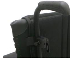
XFF 030204 Push handles, height-adjustable