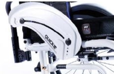
XFF040103 Aluminium, cold weather protection, fender