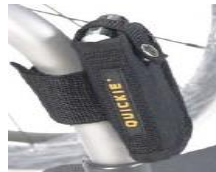
XFF090026 Mobile phone pocket