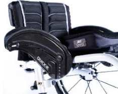
XFF040104 Carbon fibre, cold weather protection, fender