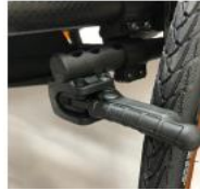
XFF060023 Compact brake EVO