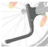
XFF090001 Tip assist