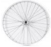
XFF070001 Universal wheel