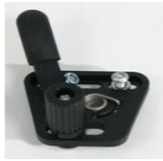
XFF060001 Standard brake