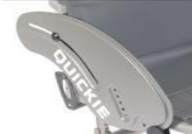
XFF040102 Aluminium, cold weather protection