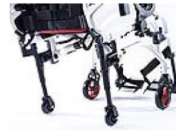
XFF090010 Transit wheels