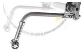
XFF090050 Anti-tip tubes, plug in, pair