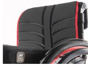
XFF 030316 EXO backrest sling (EXO Evo version)