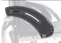
XFF040101 carbon fibre, cold weather protection, slim