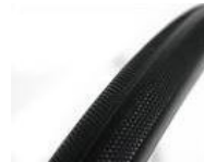
XFF070102 Tyre, puncture proof