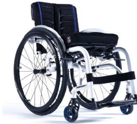
XFF090020 / 21 Hybrid frame