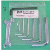
XFF090000 Tool kit