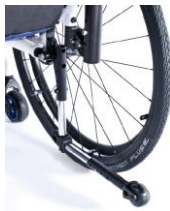
XFF090004 Anti-tip tubes, swing away