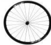
XFF07000 Proton wheel