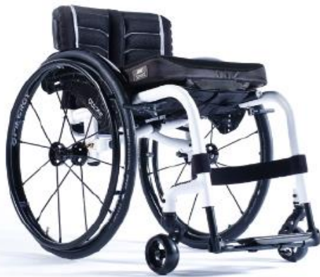
XFF010012 / 13 Open Frame