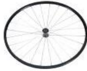
XFF070003 Lightweight wheel