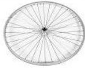
XFF070002 Design wheel