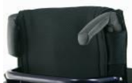
XFF 030203 Push handles, fold-down