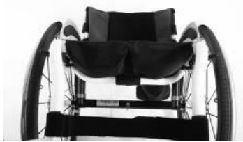
XFF 020003 Seat sling with utility bags 2