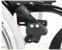
XFF060002 Knee lever brake