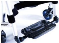
XFF050132 Footboard platform, lightweight, carbon fibre